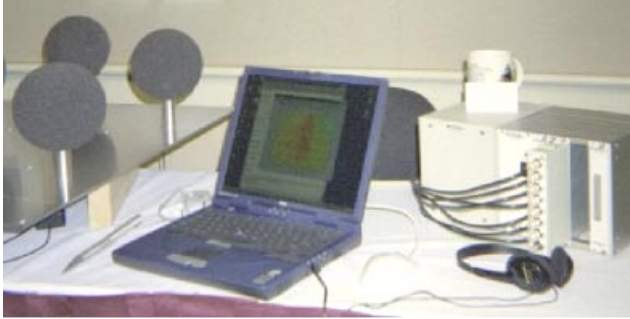
Figure 1: Acoustic array hardware. Three microphones are seen at left. The National Instruments SCXI chassis is on the right, and the laptop containing the data acquisition card is in the middle.