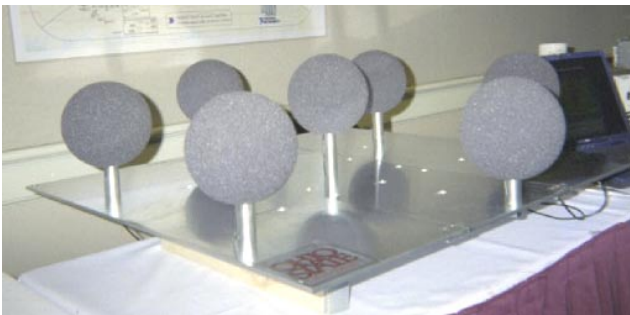
Figure 2: Indoor array configuration board.

The microphone array is configured in one of two ways. For indoor applications, we have built an aluminum platform with 23 milled holes for placement of the microphones (see Figure 2). Several array geometries can be tested by moving the microphone mounts to different holes on the platform. For outdoor data collections, we have built a set of aluminum spikes to drive into the ground at desired locations.