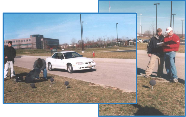
Figure 3: Photographs from an outdoor data collection using the acoustic array. A three-element triangular array of microphones was used to collect signals from vehicles driving by and of overhead aircraft.

Students prepared weekly written progress reports and met weekly with a faculty instructor as subgroups to discuss progress and ask questions. In addition, each group prepared a Preliminary Design Review at the end of the fourth week, and a Final Design Review at the end of the quarter. Both reviews included a written report and an oral presentation. The report and presentation addressed both the technical design and the team management plan.